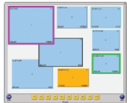
Remote operation and set-up via a web browser